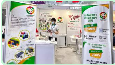
Chinaplas 13-16 April 2021 | Shenzhen, China