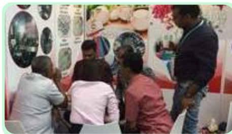
PLASTINDIA International Plastics Exhibition, Conference & Convention