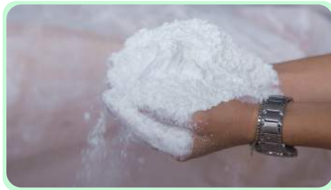
1.High Quality Input Materials