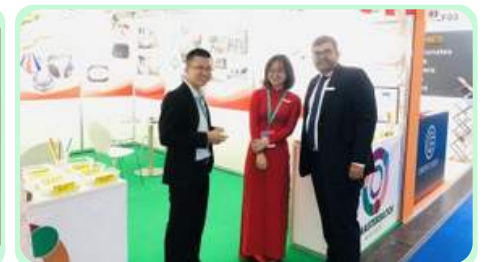
K 2019 The World's No. 1 Trade Fair for Plastics and Rubber 14-18 October 2019 Cologne, Germany