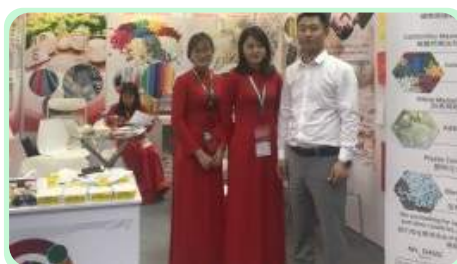
T-PLAS The World's No. 1 Trade Fair for Plastics and Rubber 14-18 October 2019 Cologne, Germany