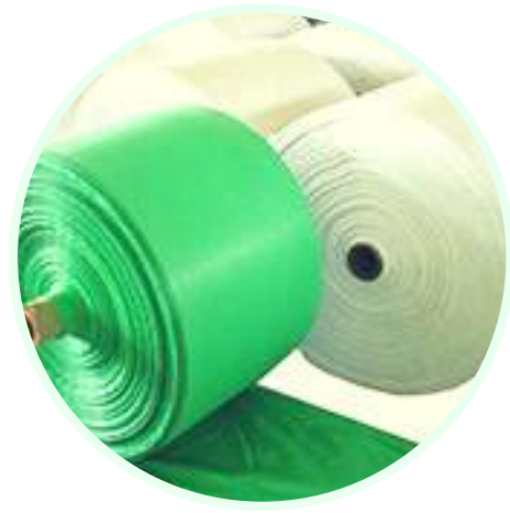
PP WOVEN SACKS & FIBC