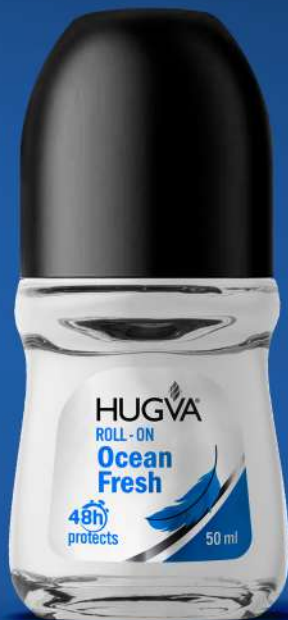
Hugva Roll-On Ocean Fresh 50 ml MM11.2311