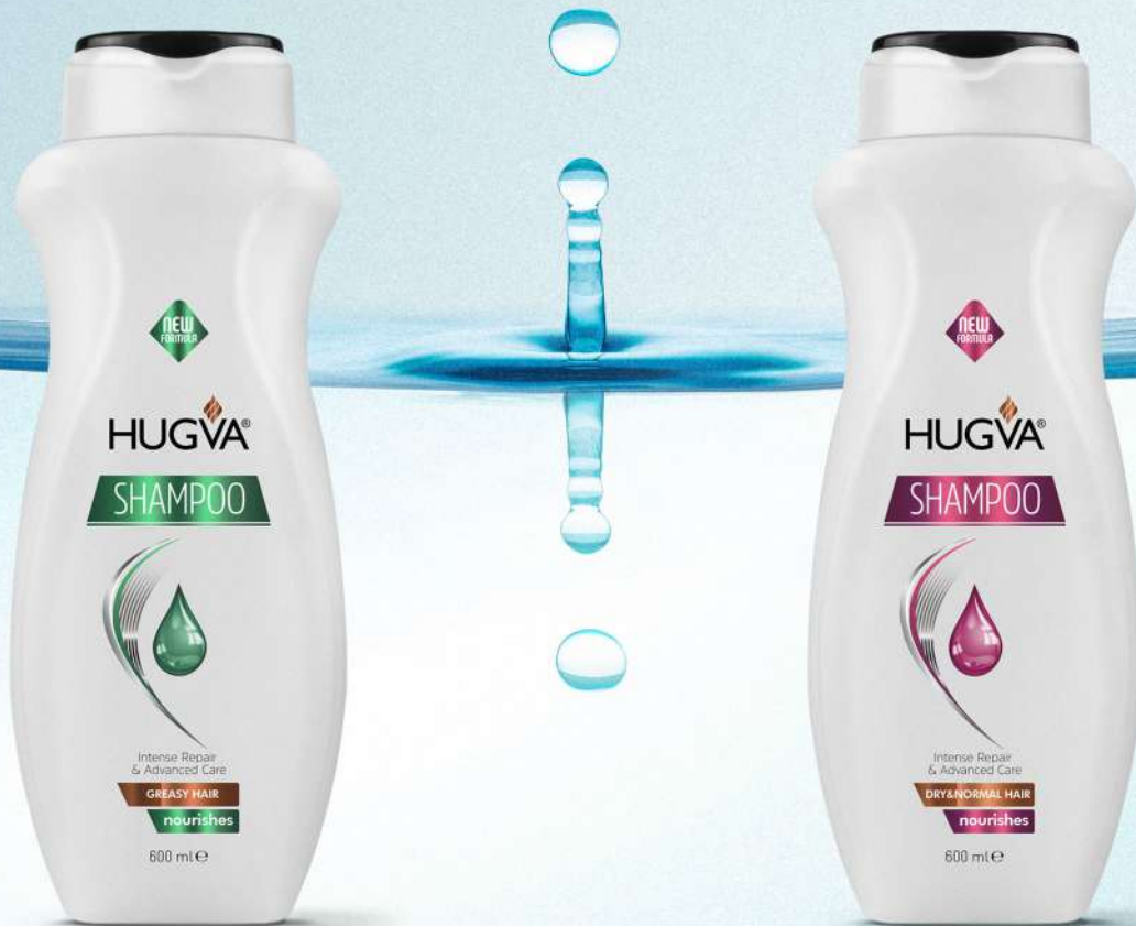
Hugva Shampoo Greasy Hair 600 ml MM11.2012