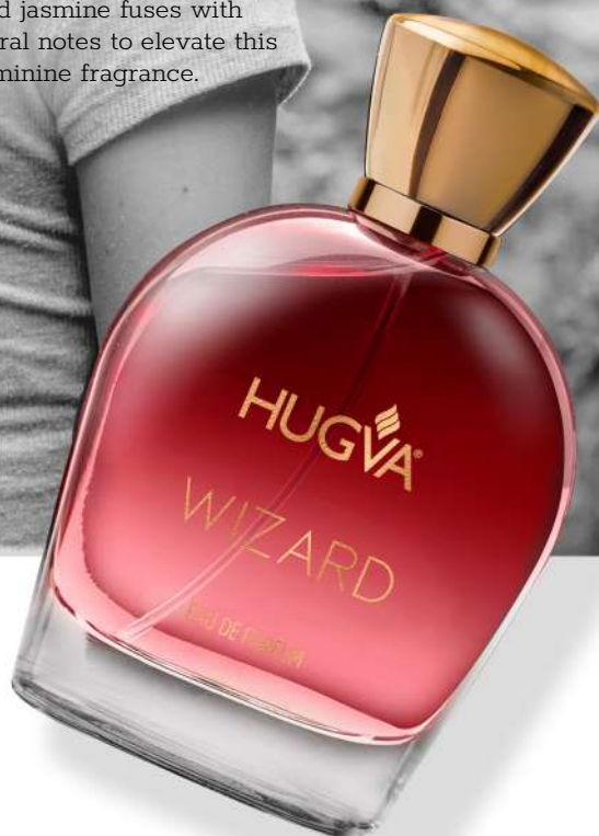
Hugva Perfume Wizard / Women 100 ml MM11.6101

Each drop provides a potent and unforgettable fragrance of grapefruit and lemon.