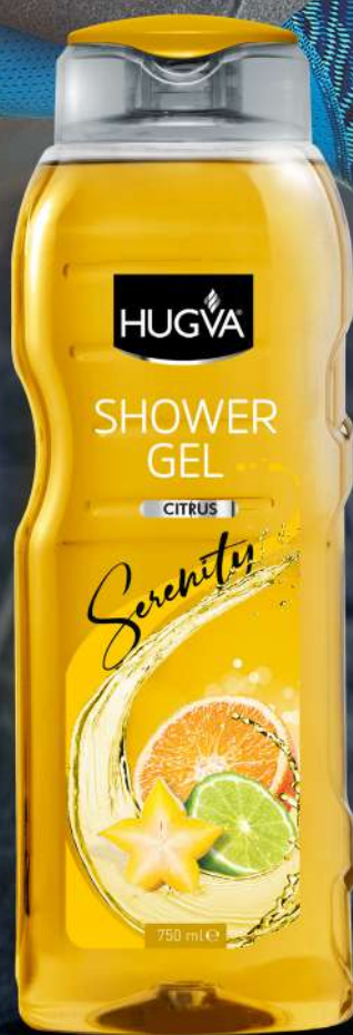
Hugva Shower Gel Serenity 750 ml MM11.2121