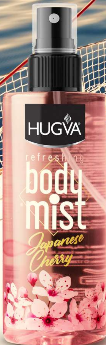
Hugva Body Mist Japanese Cherry 250 ml MM11.2301