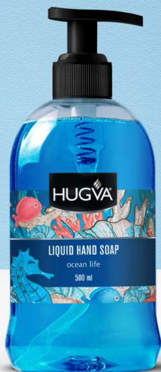
Hugva Liquid Hand Soap Ocean Life 500 ml MM11.2205

Hugva liquid hand soap removes dirt and germs while conditioning skin. Enriched with minerals and elements from sea and nature. Special skin therapy formula leaves skin feeling soft and smooth. Discover a new way to clean and nourish your skin.