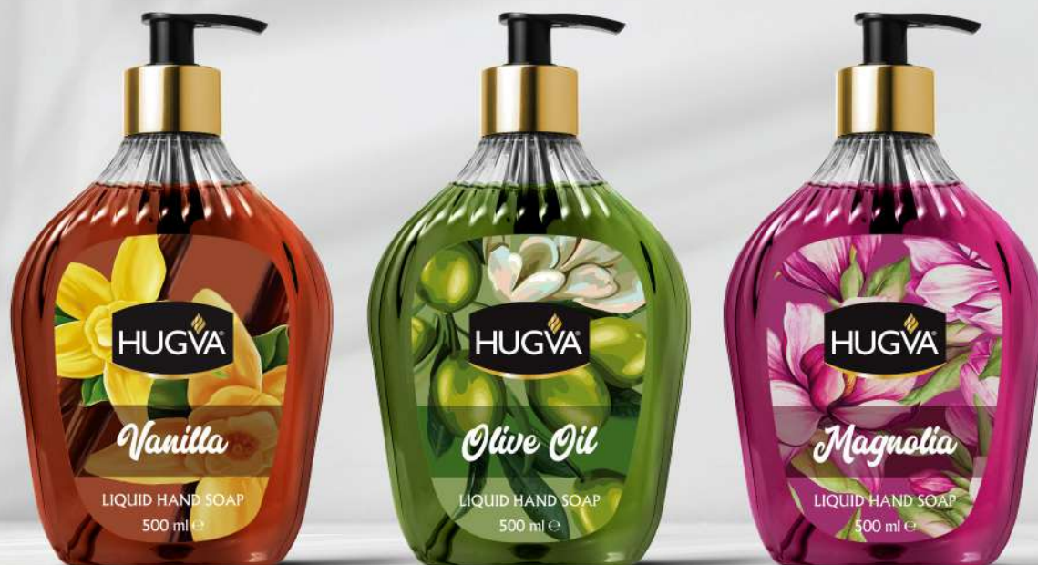
Hugva Hand Soap Vanilla 500 ml MM11.2200

Enriched with natural extracts, the special formula of Hugva Liquid Hand Soap gently cleanses your skin without harming it and keeps your hands moisturized and soft thanks to its moisturizing effect.