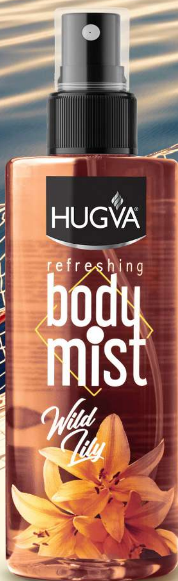
Hugva Body Mist Wild Lily 250 ml MM11.2300

Using an artisanal craft to extract essential oils from plants, we've captured the therapeutic power of pure nature. It inspires tranquility and promotes a peaceful spirit.