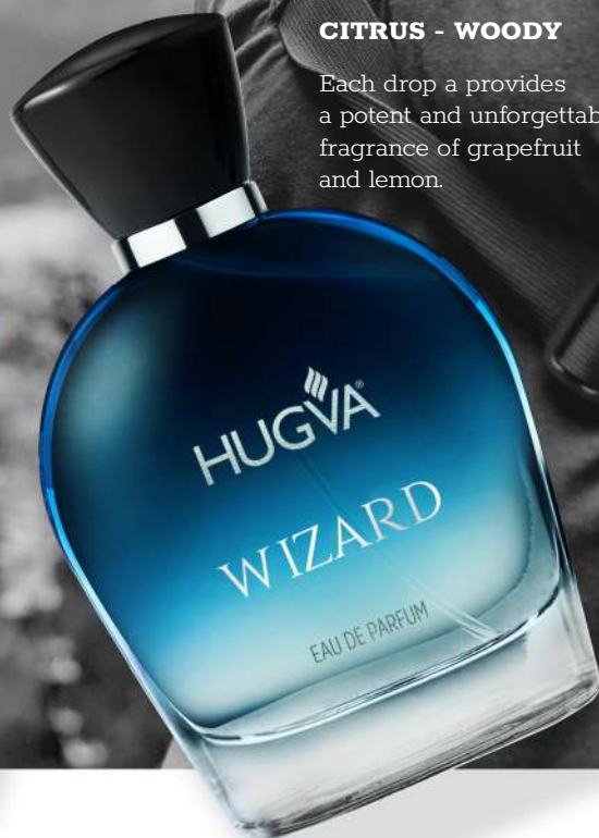
Hugva Perfume Wizard / Men 100 ml MM11.6001