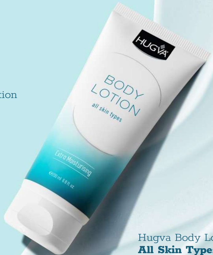
Hugva Body Lotion All Skin Types 200 ml MM11.2330

Hugva Body Lotion instantly replenishes, hydrates, and protects dry skin for 24 hours. This rich, creamy moisturizer contains a blend of moisturizing ingredients to help relieve dry, sensitive skin, leaving it nourished, soft, and smooth.