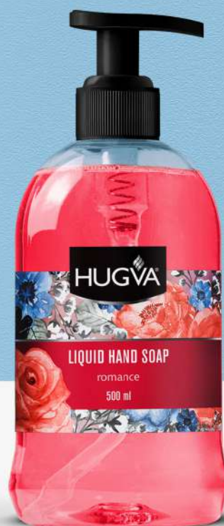
Hugva Liquid Hand Soap Romance 500 ml MM11.2204