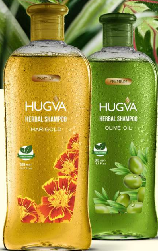
Hugva Herbal Shampoo Olive Oil 500 ml MM11.2061

Hugva Herbal Shampoo with Botanical Extracts helps support strong, healthy, growing hair. Its rich, luxurious formula gently cleanses, conditions and detangles hair while it thickens and returns hair to its natural healthy condition. Restores moisture to dry, brittle and damaged hair. Safe to use on all types of hair including color treated, bleached and relaxed.