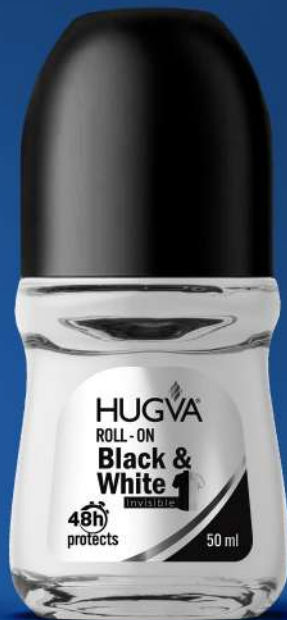
Hugva Roll-On Black & White 50 ml MM11.2312