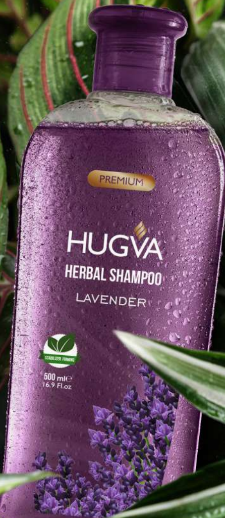
Hugva Herbal Shampoo Lavender 500 ml MM11.2060

is designed to nourish and support every strand, leaving you with touchably soft hair that provides a healthy feeling.