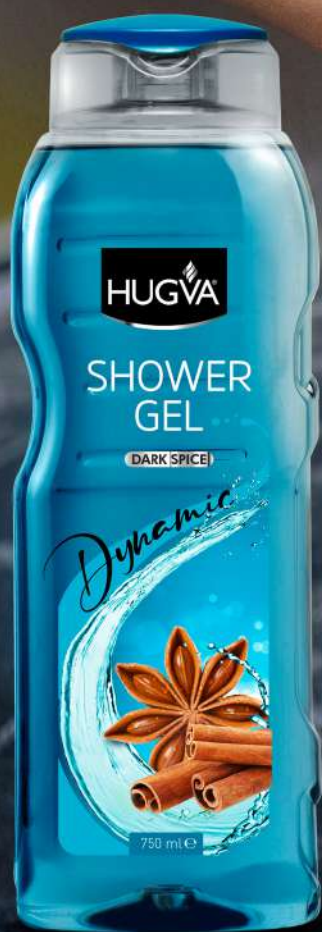
Hugva Shower Gel Dynamic 750 ml MM11.2120

For the ultimate shower experience after sports