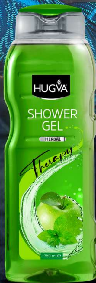
Hugva Shower Gel Therapy 750 ml MM11.2122