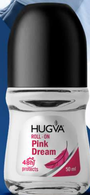
Hugva Roll-On Pink Dream 50 ml MM11.2310