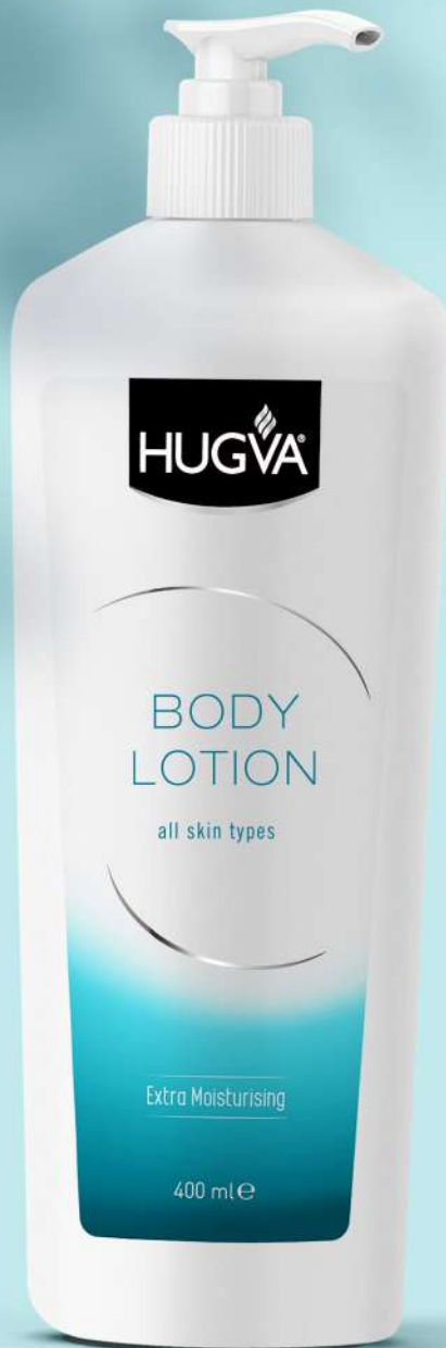
Hugva Body Lotion All Skin Types 400 ml MM11.2331