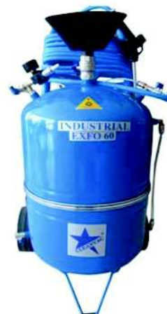
FOAM SPRAYING MACHINE EXFO 60