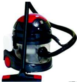
Steam cleaning Robot Cleanvac 6200 3000 watts