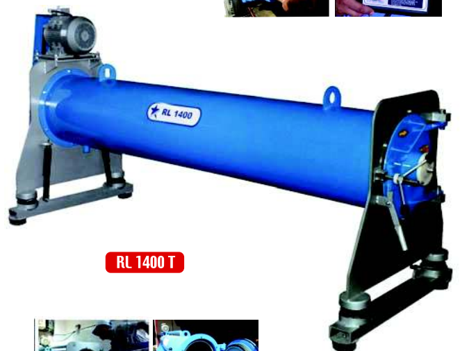
RL 1400 T