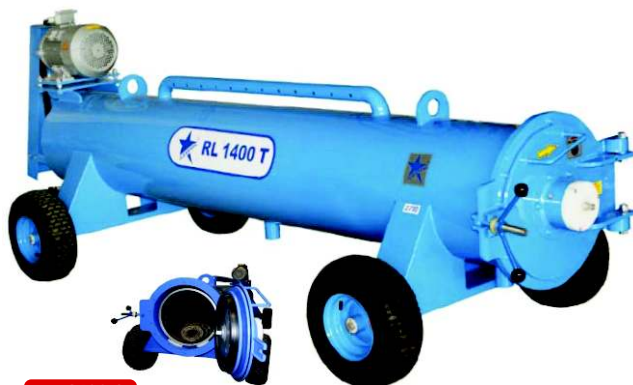
RL 1400 A