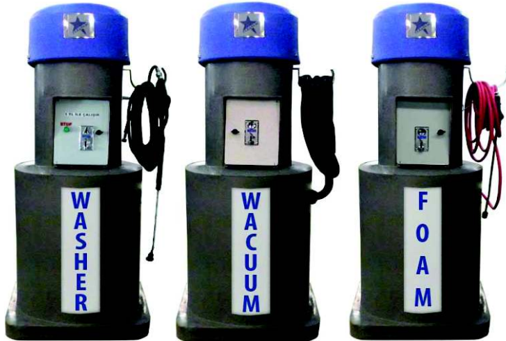
H 220 SS