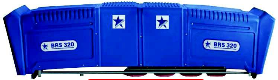
BRS320 Automatic Carpet Washing Machine

With the use of control pannel on the machine ,how much water and detergent to be used and how long brushing and drying will be made can be adjusted and put into the systems memory.Provided with this washing program, desired quality of cleaning can be used as standart and as many times as needed. The computer system enables operator to diversify washing time, consumption of water and detergent and set it into the system'memory for later use.