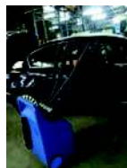
AHTAPOT SUN 68