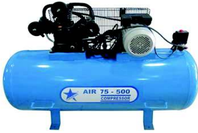
CLAENVAC AIR 75 500