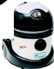
Wet & Dry Vacuum sweeper Cleanvac 5200 1600 watts