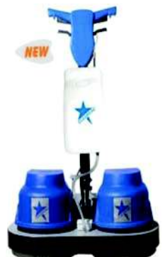
SC 43 D