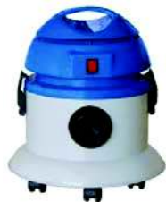
Eco 21 Sweeper 1400 watts