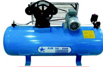
CLAENVAC AIR 30 200 Lt

Equipped with automatic START - STOP system, single or double stage working available. High air flow, protection against high amperage, easy installation